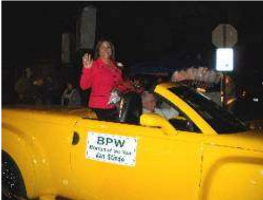
WOMAN OF THE YEAR