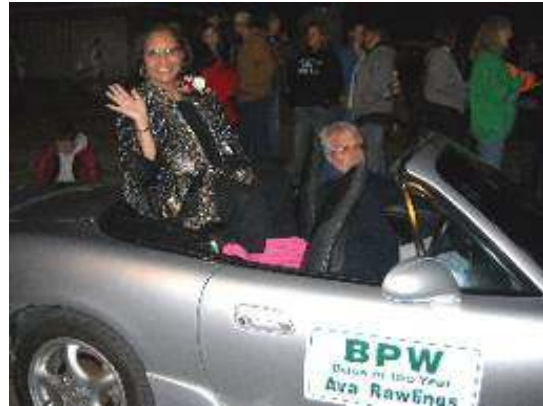
BOSS OF THE YEAR