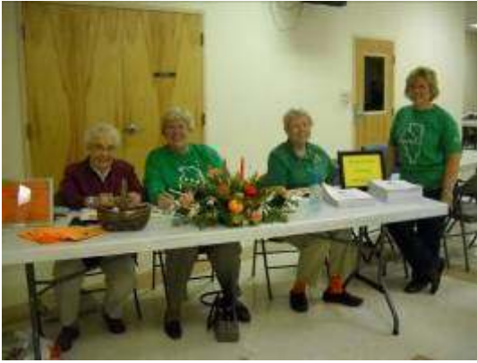
SCHOLARSHIP SALAD LUNCHEON