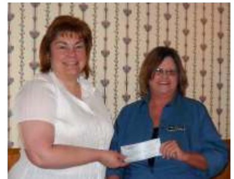
NOVEMBER DONATIONS TO P.A.V.E. & LIBRARY