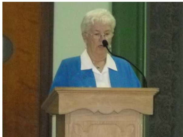
A DEVOTIONAL BY BEV VIROBIK