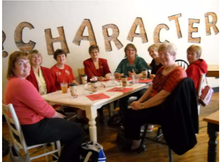
Members enjoy Un-happy Hour on Equal Pay Day, April 20, 2010