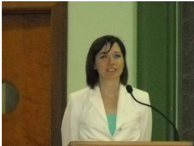
THE HONORABLE ERICKA SANDERS